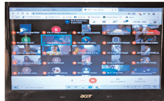
together, stays together.

It was an amazing start of the day. Weekend morning, rains outside and students all set to cook for their families inside. Wisely said by someone, A family that eats together stays together. But after today's activity, we can definitely add something more to this quote. A family that cooks together, eats to-