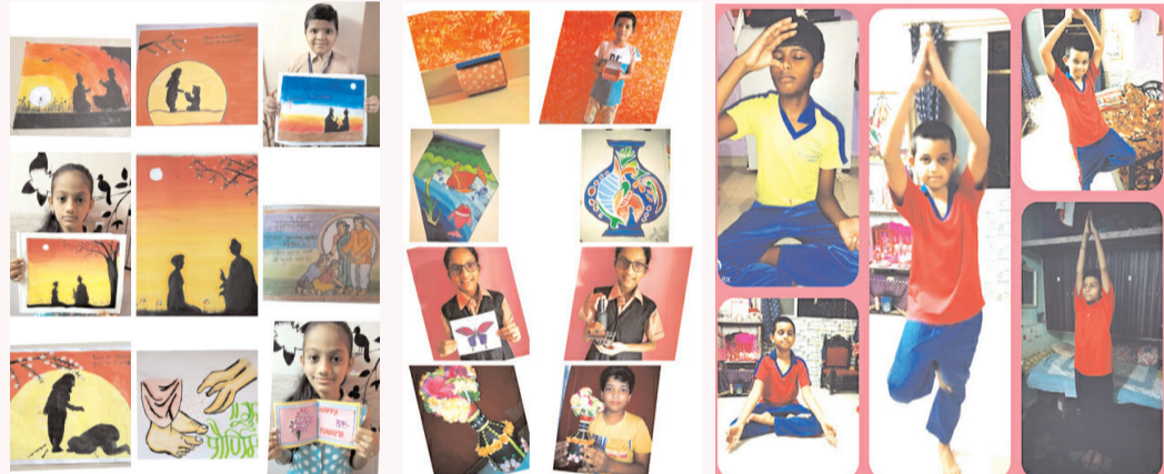
FATHERS' DAY CELEBRATION

Regular online classes have commenced from the month of June and students' participation in these classes have been extremely encouraging. The students being of this recent generation and being tech savvy in nature have started helping the teachers get on with this new age technology and the teachers have shown remarkable alacrity in adapting to the new